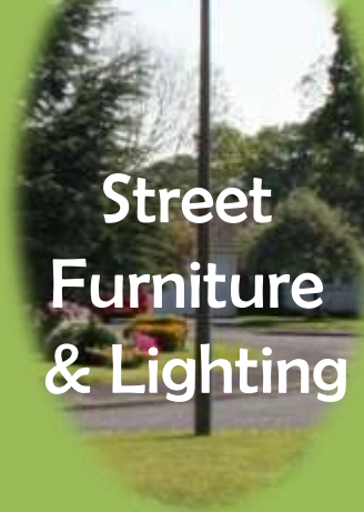
Street Furniture & Lighting