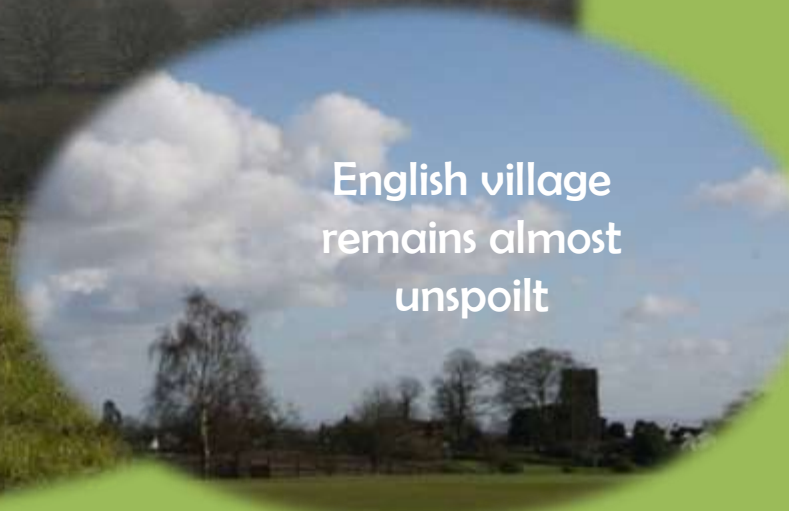
English village remains almost unspoilt