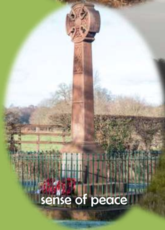
sense of peace