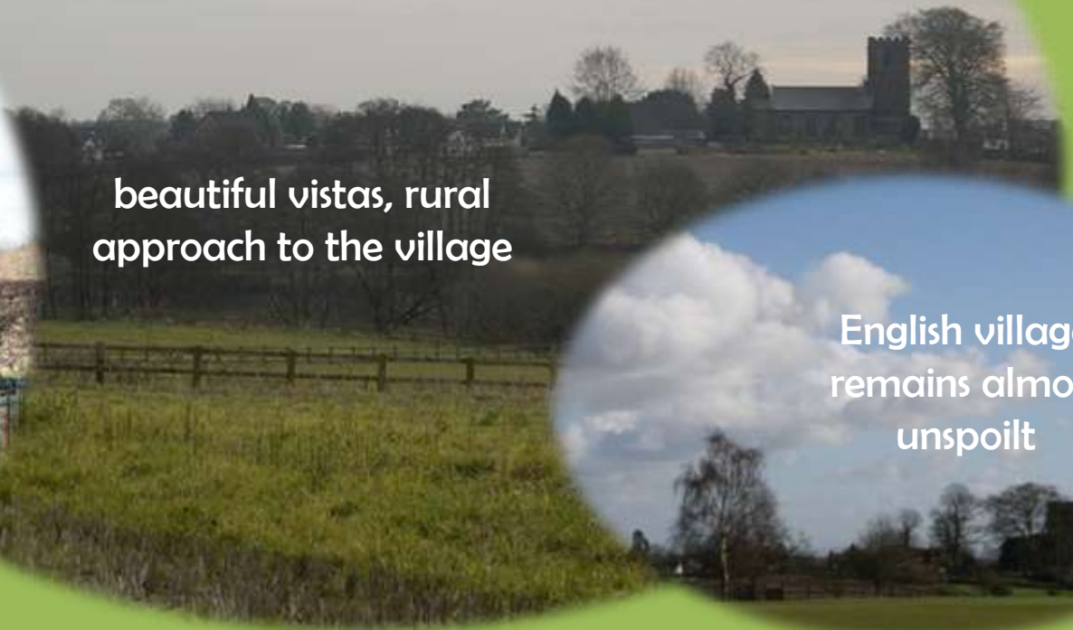
beautiful vistas, rural approach to the village