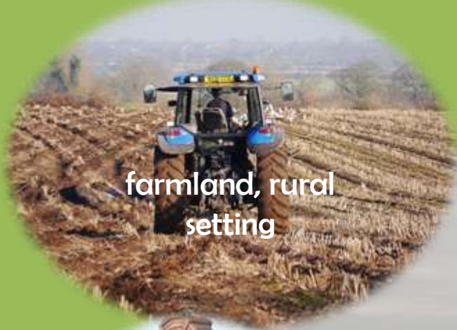
farmland, rural setting