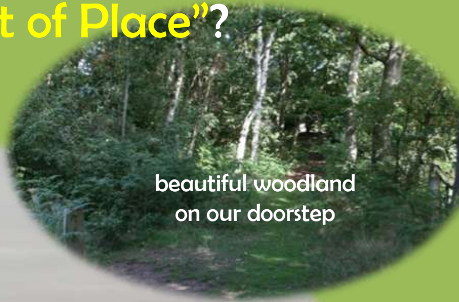
beautiful woodland on our doorstep