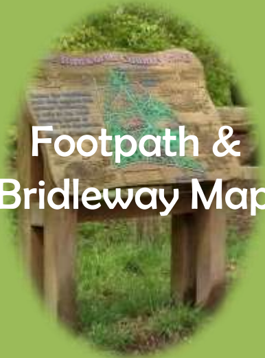
Footpath & Bridleway Maps

The survey identified these new activities . We have a volunteers list but we are looking for people to come forward who have an interest in getting things moving in these areas.